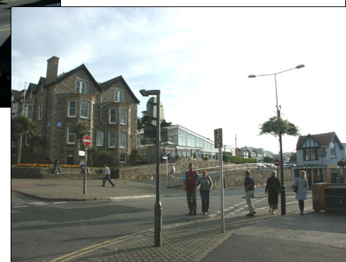
The relocation of the bus station provides an exciting opportunity for the creation of a town square. There is potential to create a major focal point within the town and better integrate the urban core with the Killacourt and the coastline