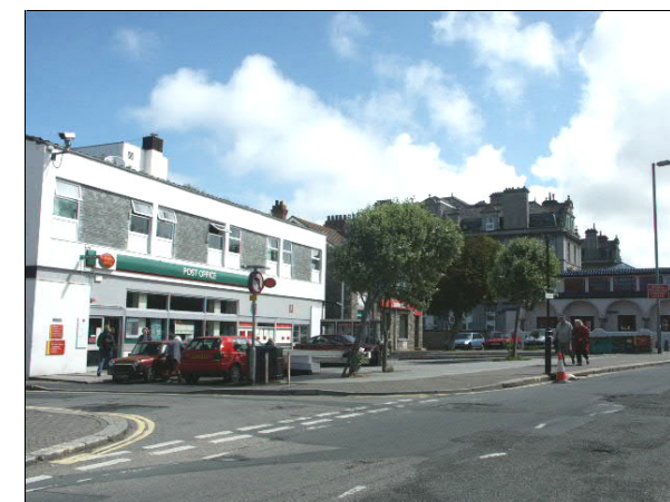
The Post Office square has potential as an important focal point within the town