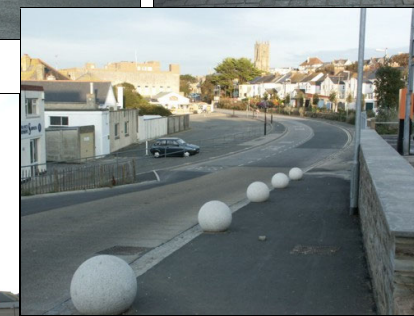
Promote the former mineral tramway as an important traffic free connection between the town centre and the railway area