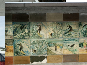
Continue railway station enhancements