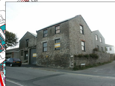
Sensitive adaptation of former industrial buildings