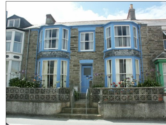
Maintain and retain historic architectural details