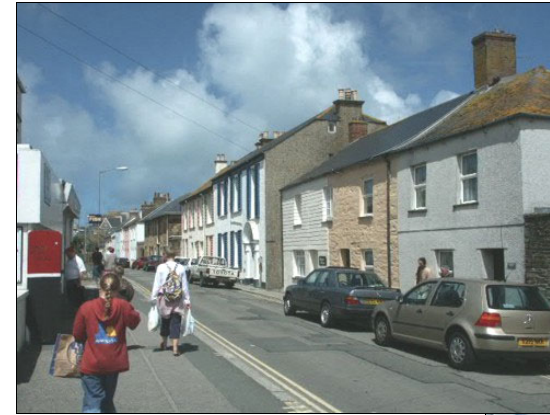
A domestic-scale built environment: small pre-urban cottages, stone terraces and larger residences.