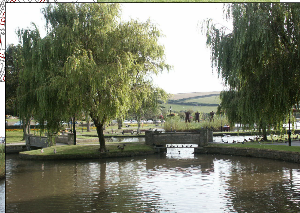
The boating lake. A wildlife habitat and important recreational amenity