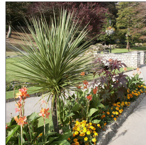
‘Sub-tropical’ planting of the flower beds ‘Heritage cottages’ originally a malt house, recently a museum. Now require conservation repair and reuse