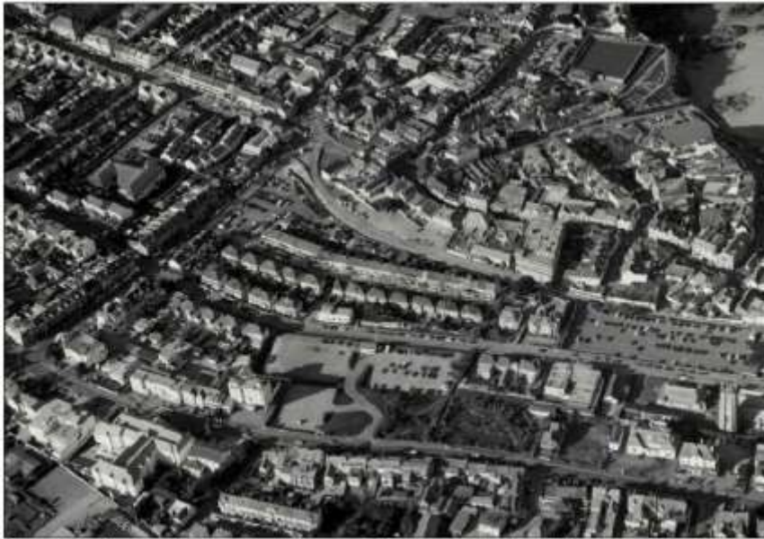
Settlement forms: the contrast between the irregular plan form of the historic core, focused around the coombe, and the grid-iron uniformity of the later expansion (CAU AP F 58/41 2002)

What is the typical layout of the area or parts of the area? Eg connected regular streets, main street and narrow opeways, cul de sacs and minor footpaths? Do the buildings provide a strong and continuous enclosure to the streets and spaces? or are they set back behind walls or even open parking? Are there large gaps between buildings? Is the area well connected with safe streets to other parts? Are there public areas or routes not overlooked by the front of buildings?